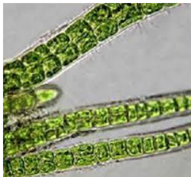
Figure 2. Platymonas subcordiformis a marine green microalgae

Mei et al. [38] suggested that Platymonas subcordiformis , a marine green microalgae (Figure 2), had a very strontium uptake capacity, although high concentrations of strontium cause oxidative damage, as evidenced by the increase in lipid peroxidation in the algal cell samples and the decrease in growth rate and chlorophyll contents.