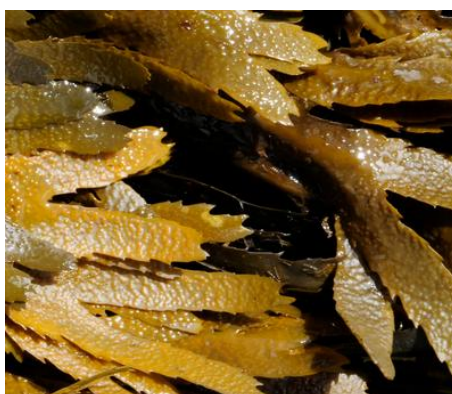
Figure 1. Brown algae “ Fucus serratus ”

The brown algae ( Phaeophyta ) are particularly efficient accumulators of metals due to high levels of sulfated polysaccharides and alginates within their cell walls for which metals show a strong affinity [10]. Nielsen et al. [37] suggested that brown algae such as Fucus spp. often dominate the vegetation of heavy metal-contaminated habitats (Figure 1).