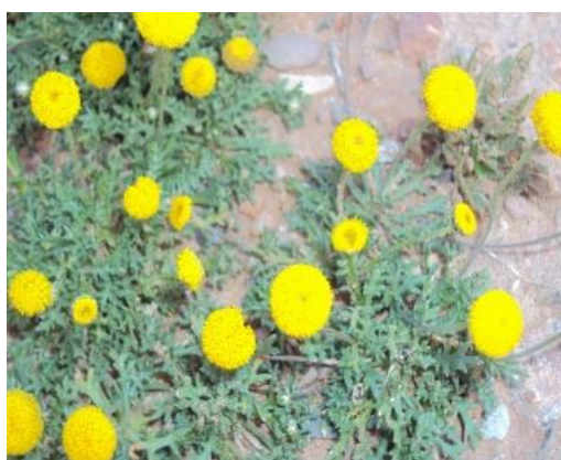
Figure 1: Aaronsohnia pubescens subsp. pubescens in its native habitat in south-eastern of Morocco (Jorf-Errachidia)

Various methods are used for volatile extraction, such as hydrodistillation (HD), Soxhlet extraction, static headspace (HS) extraction, simultaneous distillation extraction (SDE) and supercritical fluid extraction (SFE). HD is a conventional method used to extract EOs, because it can be easily implemented in industry and has no chemical pollution. However, it has certain disadvantages, particularly, the consumption of energy and time, the deterioration of heat-sensitive compounds and the low extraction yields of EOs. Recently, Solid-phase microextraction (SPME) is an alternative technique to the traditional HD extraction, which has been successfully applied qualitatively and quantitatively for the analysis of various food samples, and flavors and aromas of many medicinal plants [14]. In this context, the aim of this work was to compare the volatile constituents of APP from Morocco (Figure 1), using the HD and HS-SPME extraction techniques.