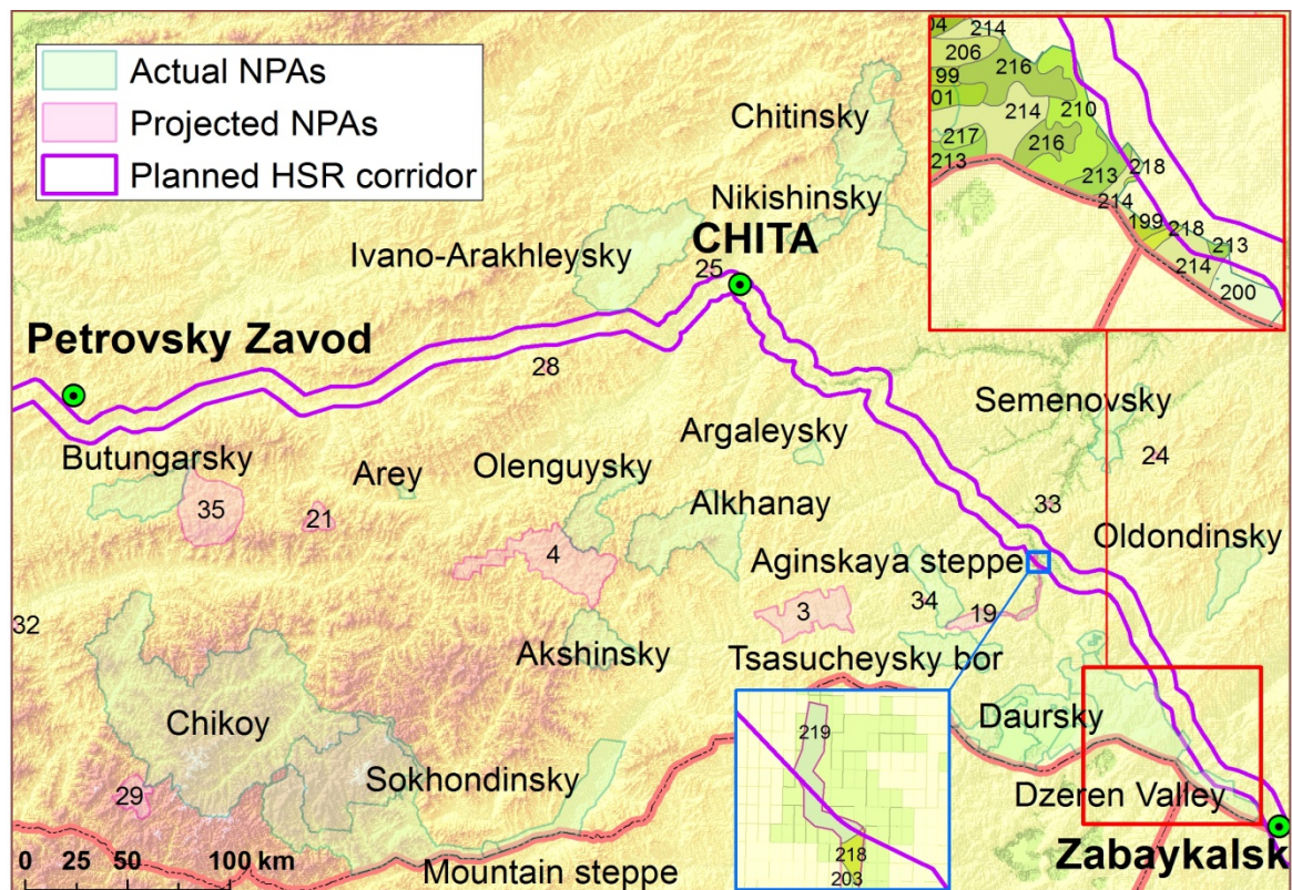
Figure 4: Natureprotected areas and HSR line.

As for the risks and threats of the projected HSR impact on the existing NPAs system of the region, in accordance with the proposed track variant (Figures 2 and 4) it does not cross the boundaries of any nature protected area. However, in the vicinity of HSR there are several NPAs (Figure 4) the environment formation and, consequently, security function of which is under the threat. These are the State Nature Biosphere Reserve “Daursky” (northern cluster and “Adon-Chelon” area), the federal reserve “Dzeren Valley”, the natural park “Ivano-Arahleyskiy” and 14 natural monuments.