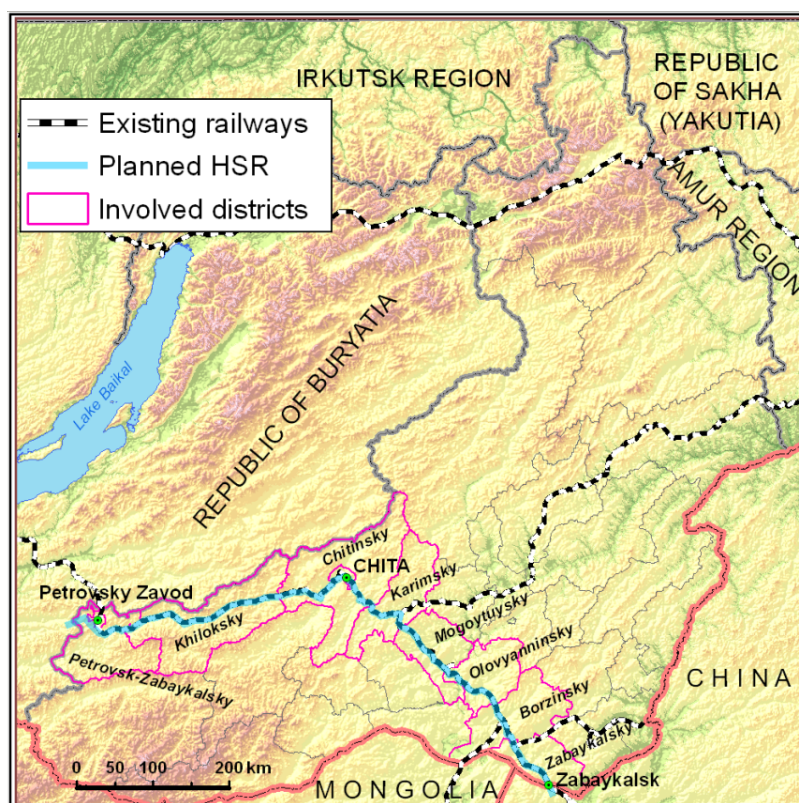
Figure 2 : HSR option for the Trans-Baikal Territory.

Technologies of geographic information systems (GIS) are widely used in the environmental impact assessment process. However, initially the GIS use within the ecological assessment was usually limited to its visualization functions, and its analytical capacities were seldom used [49]. At present, many researchers commonly include the analytical GIS tools, the spatial analysis and modelling methods in their studies. It is believed that the GIS technologies use provide an easily interpretable and unbiased environmental impact assessment [50]. The authors have used GIS analysis early in the environmental impact access for several Russian projects [51-61].