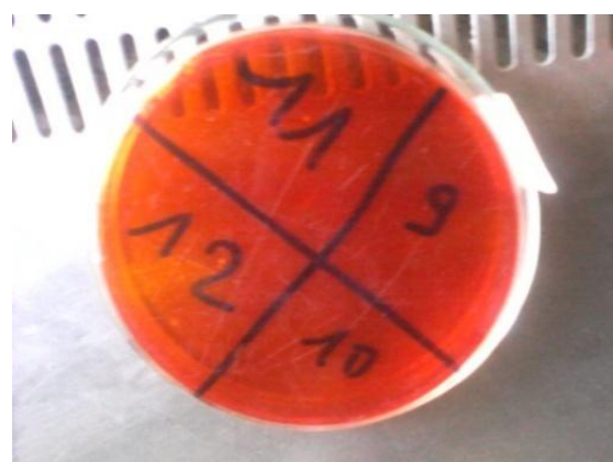
4 negative tests