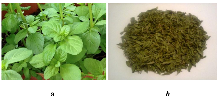
Figure 1: (a): fresh leaves of Mentha pulegium L. ; (b): dry leaves of Mentha pulegium L.

Mentha pulegium L. was collected from Tarik Ibn Ziad village within the region of Ain-Defla located in northern Algeria, during February to April 2013. The taxonomic identification of plant material was confirmed by Mr. Kouache Ben Moussa and a voucher specimen was deposited in the Herbarium of the agronomic department, Khemis-Miliana University, Algeria. The leaves were washed with distilled water and dried in the shade for a period ranging from 5 to 7 days at room temperature, then its were powdered by a domestic blender.