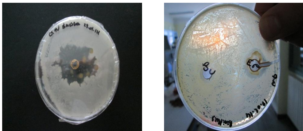
Figure 3: inhibition zone of PE and n -BuOH against Bacillus sp.