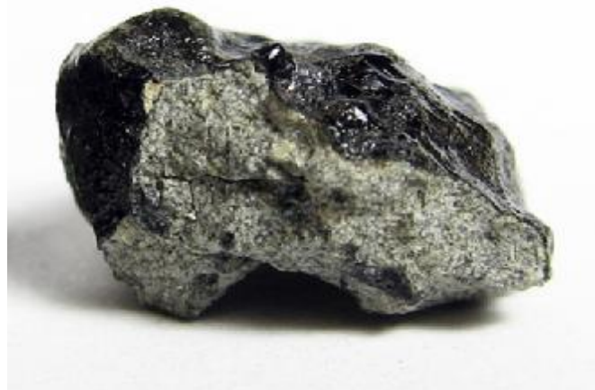
Fragment is partly crusted.