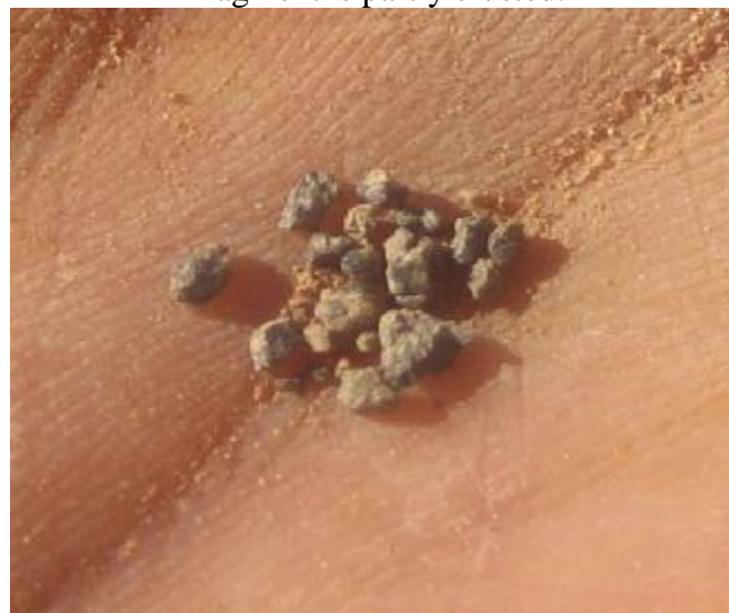
Debris of Tissint meteorite.