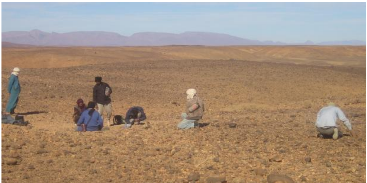
Figure 3 : Nomads collecting debris of the Martian meteorite of Tissint (Tâta Morocco).