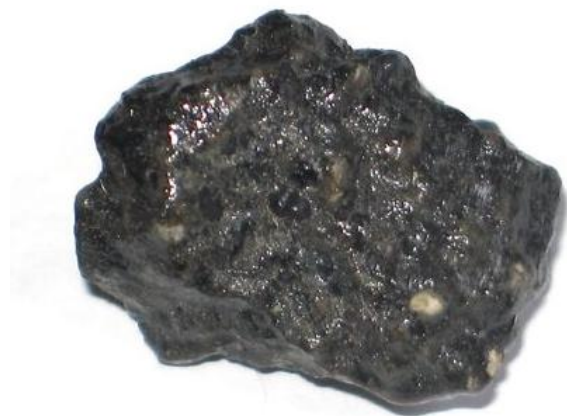
Fragment is completely crusted.

Sm/Nd = 0.646, indicating that this specimen has affinities with the depleted compositional group of shergottites. One particularity of the beginning scientific work, which is unique in the sense, that the just starting research work about this meteorite, showed that this is a very fresh rock and that the megacrysts of olivine show crystal defects filled generally with fluids. These information will be very interesting for the study of fluids of the red planet.