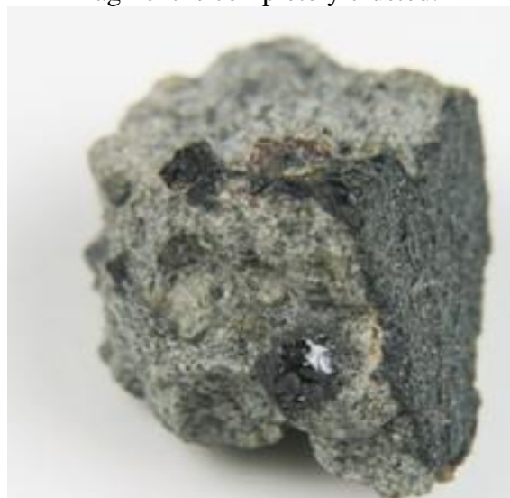
Crust only on a small fraction.