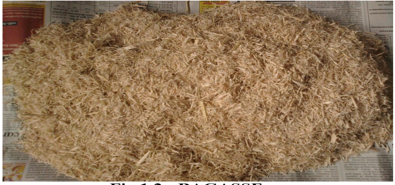
Fig 1.2: BAGASSE